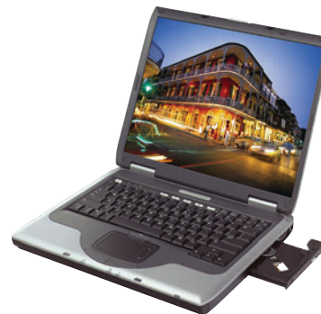
LCD laptop using GE Plastics' Illuminex* diffuser films

Offering very good performance in almost every respect, our products can help you to deliver a reliable and high image quality product.