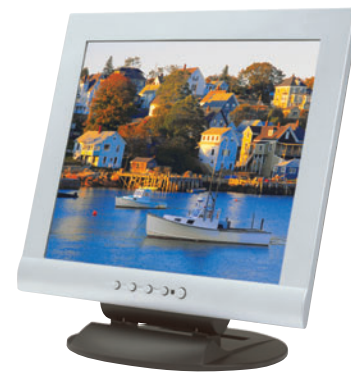
LCD monitor using GE Plastics' Illuminex* film

InvisiSil* LED encapsulants deliver a high refractive index and light transmittance to effectively transmit light emitted from LEDs. InvisiSil* LED encapsulants can also address the need for enhanced performance and long-term reliability in backlight units. This series of silicone encapsulants helps contribute to device durability and dependability with their long term resistance to yellowing and to delamination of the encapsulant from the substrate.