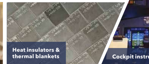
Heat insulators & thermal blankets