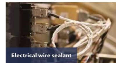
Electrical wire sealant