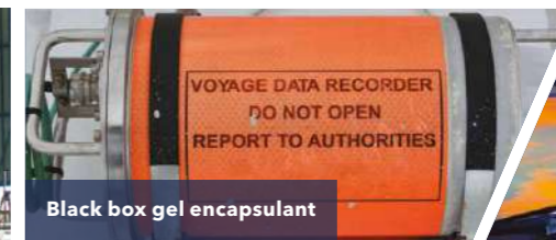
Black box gel encapsulant