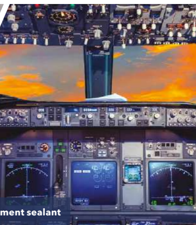
Cockpit instrument sealant